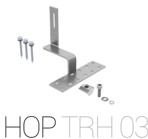
Tile Roof Hook #03