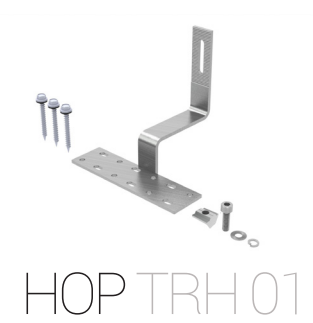
Tile Roof Hook #01