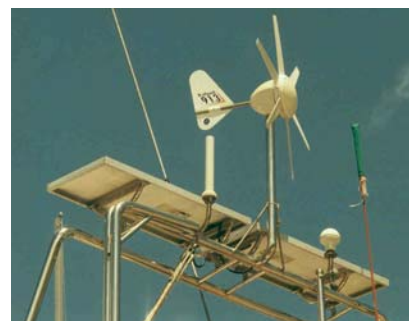
Rutland 913 mounted on a gantry