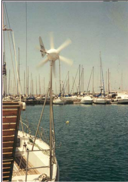
Rutland 913 mounted on a pushpit

For pleasure, liveboard and professional sailors the task of maintaining continuous power is made easy with a Rutland 913 Windcharger on board. Essential navigation equipment, lights and the home comforts of a refrigerator, laptop computer and even a hairdryer can be used without the need to run the engine.